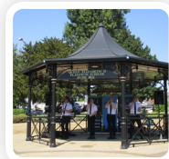
Hinckley & Bosworth Borough Council

Male vocal trio 'Hometown' perform old and new covers in the beautiful Argents Mead.