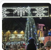
Hinckley & Bosworth Borough Council

Starting at 4pm on Friday with live entertainment in the Market Place, a range of market stalls and street entertainment followed by the lights switch on at 6:30pm. The Tin Hat Fair will be on Regent Street on Friday 4 - 10pm and continues on Saturday 12noon to 10pm.