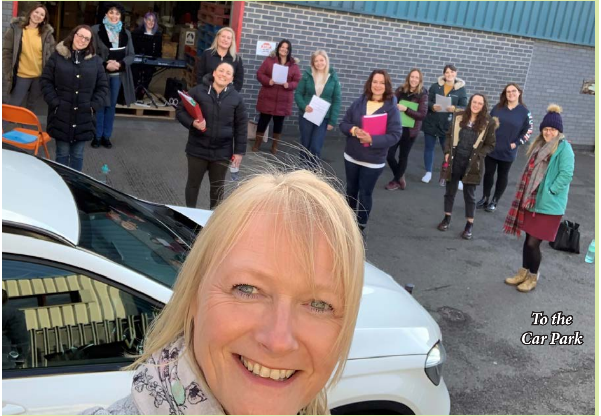
To the Car Park