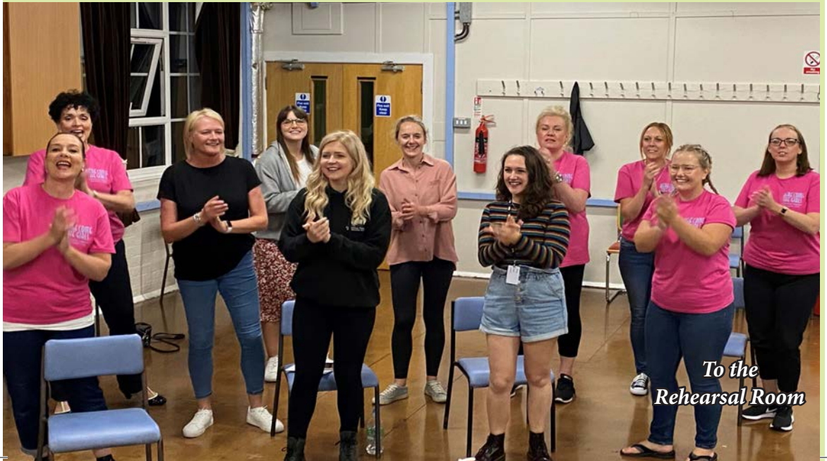
To the Rehearsal Room