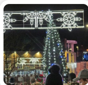
Hinckley & Bosworth Borough Council

Starting at 4pm on Friday with live entertainment in the Market Place, a range of market stalls and street entertainment followed by the lights switch on at 6:30pm. The Tin Hat Fair will be on Regent Street on Friday 4 - 10pm and continues on Saturday 12noon to 10pm.