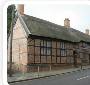
Hinckley & Bosworth Borough Council

A celebration of Hinckley's heritage with Hinckley Museum, the Atkins Building and others opening their doors to the public, as well as a display by Hinckley District Past and Present in the town centre and other heritage activities.