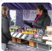
Hinckley & Bosworth Borough Council

Your Festive Feast and Crafts Market returns to Market Place in Hinckley. Enjoy a range of street food stalls, warm mulled wine and crafts stalls whilst enjoying live Christmas music and entertainment in front of the town centre Christmas tree.