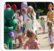
Hinckley & Bosworth Borough Council

Three fun filled days of activities for all the family in Argents Mead, the final day will celebrate 10 years of Snapdragon with a party in the park. The giant sandpit will also be back (part sponsored by Hinckley BID)