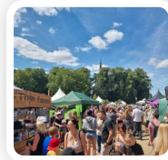
Hinckley & Bosworth Borough Council

Feast Hinckley returns to Argents Mead in 2023! Your FREE ENTRY food festival will feature around 50 street food vendors, 120ft inflatable assault course, sandpit, live music, entertainment, mini-bikers course, local radio and more! (small charge applies for some activities)