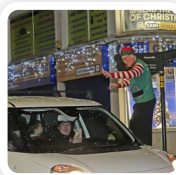
Hinckley & Bosworth Borough Council

Hinckley & Bosworth Borough Council and the United Reformed Church invite local disabled and elderly residents to come into Hinckley to see the Christmas lights. Upper Castle Street will be opened to traffic from 6pm to 8pm. Anyone is welcome to come and drive at your leisure to view the Christmas lights and then exit onto Regent Street.