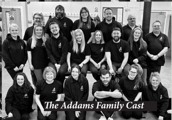
The Addams Family Cast