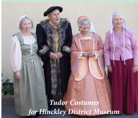
Tudor Costumes for Hinckley District Museum