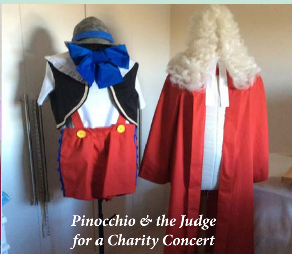
Pinocchio & the Judge for a Charity Concert