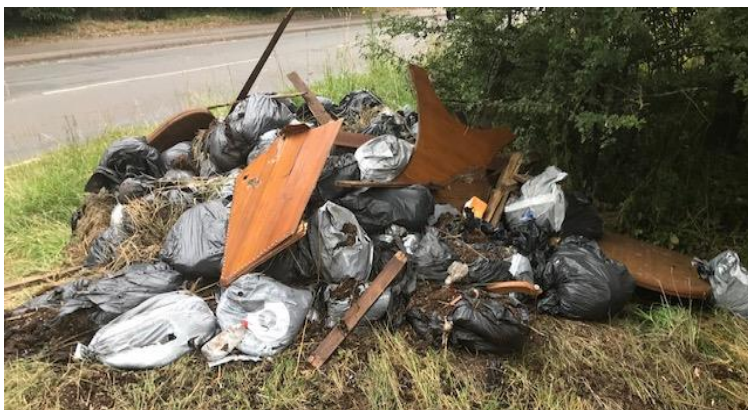
Above: two of the fly tips investigated by Blaby District Council

The Enviro-Crime Officer works closely with the District Cleansing Team and attends fly tipping incidents in a bid to recover evidence from the waste that has been illegally dumped. Once they have recovered evidence the investigation work begins to determine how the waste got there and who is responsible.