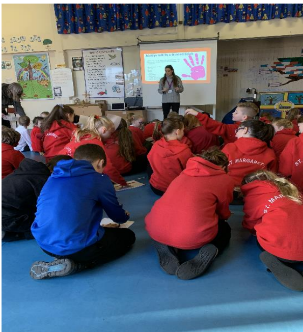
Pupils at St Margarets Primary School in Stoke Golding taking part in a Diversity workshop

Working in more than 17 primary and secondary schools already, there are many more schools booked in for the next term and staff are hopeful of exceeding targets set in previous years.