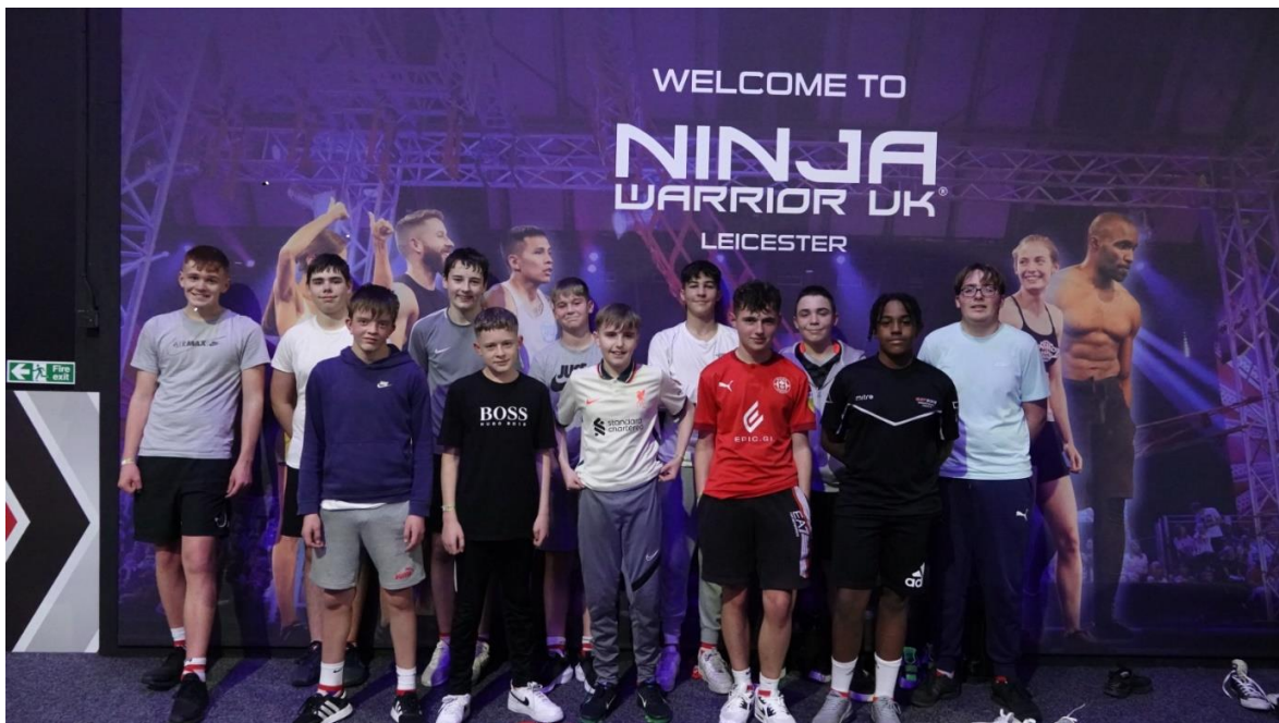
The winning Hinckley Kicks Team at Ninja Warrior in Leicester