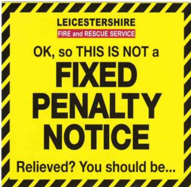
'Fake parking ticket'

LFRS have since ticketed vehicles that were causing an obstruction with advisory notices. The 'fake notices' explain that if there was an incident that needed an emergency response an appliance would be unable to get through and this could cause danger to life! Since the campaign was launched the parking in these areas has improved significantly with drivers parking more responsibly allowing access to properties.